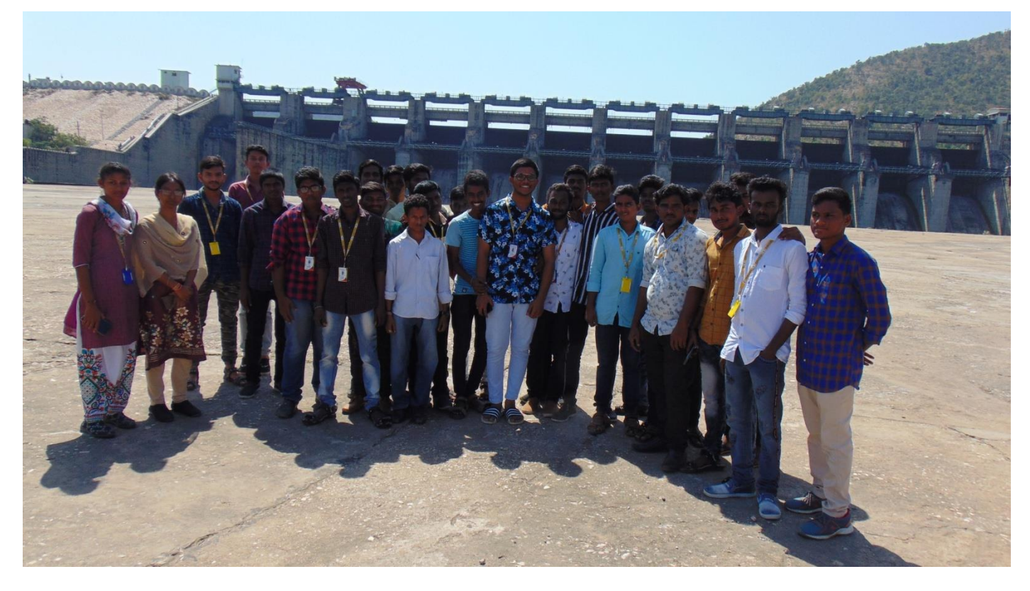
Group photo at Dam down stream side.