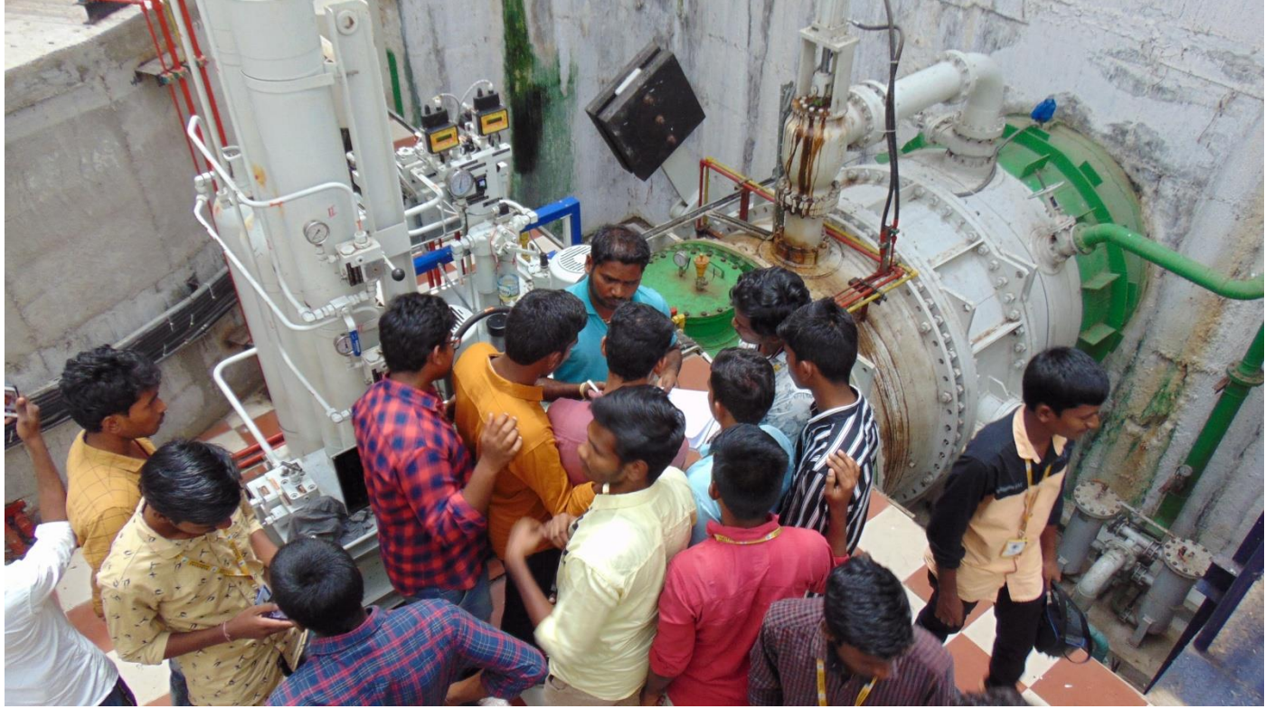
Operations Engineer Explaining about Penstock: