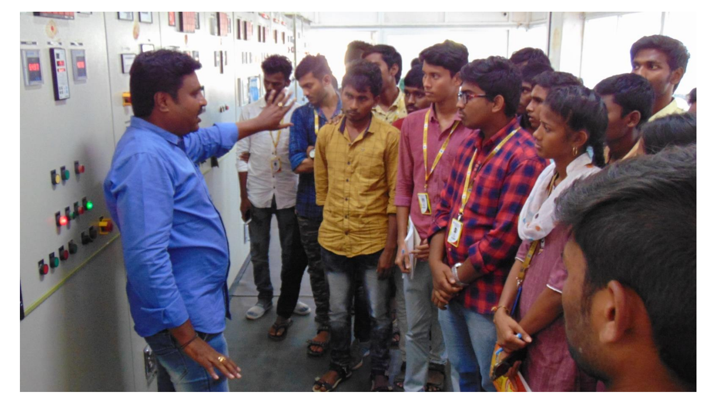
Plant A.E Briefing about controlled unit.